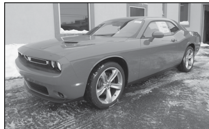
This year's grand prize is a 2017 Dodge Challenger

Donated by Advanced Collision Center LLC